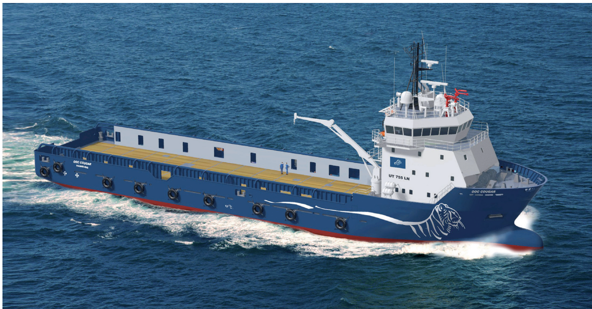
OOO COUGAR UT 755 LN DP2 design built for OOC by Aker Aukra Norway [Hull #128] and Bharati Shipyard India [Hulls #359, 360]

This document is a high-resolution pdf. Pictures and data may be easily extracted. If published, OOC would be grateful for a complimentary copy of the story.